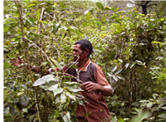
A coffee farmer from the Letefoho District. PWJ will be working with these farmers from FY2003.

East Timor's economy, now cut loose from Indonesia, is fragile. For East Timor, aside from oil and gas in the Timor Sea, coffee is the only dependable source of income. Therefore, strengthening the coffee industry is at present the country's foremost task. One serious problem that coffee farmers face is that they have little pricing power. Here, farmers have long sold harvested raw coffee fruit directly to agricultural cooperatives, since they have no proper means of processing coffee beans.