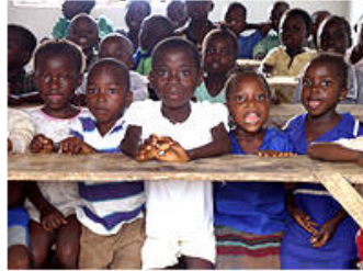
Education is a must even for children in refuge. Refugees in PWJ's camps have access to schools, toilets, showers, community centers, and medical clinics.

now managing 2 out of 8 camps for Liberian refugees. Our activities include supplying water, food, and shelter, constructing schools and wells, and implementing hygiene education. As a camp management agency, PWJ also functions as a focal point among other collaborating organs working in the camps, supporting liaison and coordination efforts. Moreover, by undertaking activities such as school construction in the villages that hosts the camps, we strive to maintain good relationship with the local community.