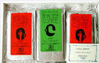
"Peace Coffee," one of PWJ's original products. There are 2 types, Guatemalan and East Timorese, both of which are natural coffees.

Efforts were also made to bring in donations from a variety of supporters. Donation and membership fees from corporations and individual supporters are an indispensable part of the funds that sustain PWJ's activities. For us, advertising and direct mailing are important means to reach a wide spectrum of people and to seek further financial contribution. By diversifying payment methods, it is now possible to make donations to PWJ through post offices, banks, or via the Internet.