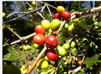
Only red, fully ripened coffee fruits may be picked and processed into coffee beans.

Such activities will officially start in FY2003. During FY2002 PWJ investigated a variety of issues ranging from refinement of coffee beans to offshore coffee markets, marketing channels, and coffee producers' life styles. This coming autumn, we will be importing initial coffee beans produced and processed by the local farmers under our support. In addition to support in coffee production, PWJ is planning to confront the problem of malnutrition, especially visible in the uplands. We will be offering technical assistance in farming and cultivation of nutritious agricultural and livestock products, such as eggs and beans.