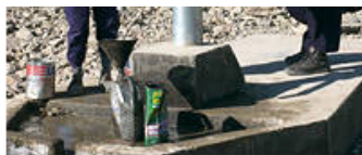
A father and child pumping water from a newly dug well. (Afghanistan)

occurred, followed by US military operations against the Taliban Regime, forcing us to temporarily withdraw from the field. For a while the situation prevented even humanitarian aid workers from entering the country. It was close to December when PWJ launched its emergency relief operations, finally reaching the people who awaited our help. The experience of failing to render support at the most critical moments left deep-rooted regret in our minds. A year