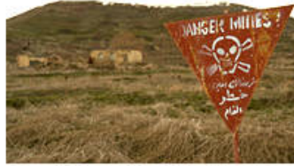
Remains of what used to be a Kurdish village. The area is now embedded with numerous landmines. (Northern Iraq)

Peace Winds Japan (PWJ) has, since its establishment in 1996, emphasized support for people who are suffering in the turmoil of conflicts. This is because we believe that it is under such situations that humanitarian relief unique to NGOs is most needed. After launching our relief activities in the Kurdistan Autonomous Region (KAR, northern Iraq) in 1996, we have gradually expanded our scale of activities to include Mongolia, Kosovo, Indonesia, East Timor, Sierra Leone and Afghanistan, where armed conflicts and natural disasters have left behind devastated lands.