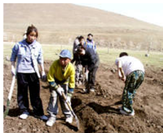
The programs at KhotAil include outdoor activities where children experience farm work and life in the country side.

The situation is still deteriorating. Large numbers of nomads have become victims of the heavy snowstorms that have occurred consecutively since 1999, forcing them to move to urban areas in search of employment. In the urban areas, however, social utilities have started to charge fees, making it barely possible for the poor to receive even fundamental welfare services. PWJ is especially concerned about the children of such families, many of whom have dropped out from school and or have started living on the streets.