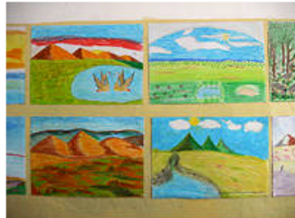
Drawing is a method adopted by PWJ for psychiatric counseling at the juvenile reformatory.

The main focus of Peace Winds Japan's (PWJ's) activities in Mongolia is support for children, especially those from families suffering financial hardship. Here, a vicious circle of poverty is taking shape. Children of poor families, mainly in urban areas, are growing up to form an additional poverty group. PWJ is working to eliminate future poverty by helping children gain skills important to life-long self-reliance.