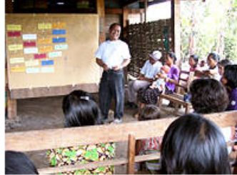
A discussion held among local residents. Here, people discuss and determine their needs by themselves.

Peace Winds Japan (PWJ) established its Jakarta Office in January 2001. In a country with frequent natural disasters and highly sensitive issues, such as religious or ethnic conflicts and separatist movements, PWJ is working to assist the local community gain self-reliance. Since the Asian Economic Crisis in 1977, rise in unemployment rates, illiteracy, and street children is apparent. Political tension also persists even after the Suharto Regime ended its 32-year reign in 1998. Under such circumstances, PWJ has conducted emergency relief in response to the all-too-frequent natural disasters and made improvements to address social problems in the capital vicinity.