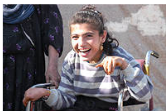
A girl with disorders in the limbs. Living in the mountainous areas, she is supported by PWJ's mobile health services. (Northern Iraq)

We see a certain similarity between the situations in Afghanistan and northern Iraq. For years the Kurds suffered under the Hussein Regime while the international society remained apathetic.