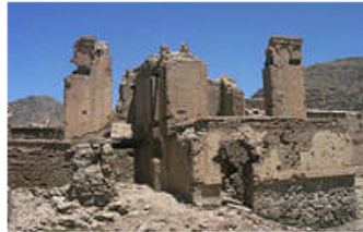
A school torn by war. The long and devastating war left many buildings as merely rubbles. (Afghanistan)

Conflicts put even the basics of life at risk. Self-reliance becomes impossible for the victimized people. Yet, diplomatic efforts achieve little if governmental functions are paralyzed. Conversely, diplomatic ties can also make it difficult for foreign governments or international organizations to take immediate relief actions. In 1999, for example, many countries hesitated to react to the chaotic situation in East Timor because of their diplomatic relations with the Indonesian government. NGOs, on the other hand, took advantage of their "non-governmental" strengths and rendered timely assistance.