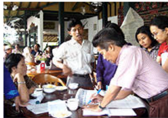
Through workshops, teachers are guided to acknowledge the importance of children's rights.

The vital point is to strengthen the capabilities of local NGOs and local residents to resolve problems independently. If the local community continues to rely on aid from outside, it will never become capable of finding individual solutions to local problems, and the community as a whole will become brittle. Taking this into account, PWJ does not directly assist local residents, but works as a partner in collaboration with local NGOs. Our partner groups manage most daily activities, while PWJ provides indirect support such as monitoring or strategic advice. We hope that such an approach will also lead to the capacity building of local NGOs.