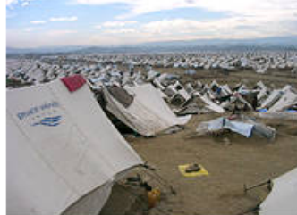
An IDP camp full of winterized tents. (Afghanistan)

Our activities in conflict areas are accompanied by danger. Social infrastructures are destroyed, transportation and communication networks are torn, and security systems, non-existent. In most cases, Japanese residents, including PWJ staff, are advised by their government to swiftly evacuate the area. To carry out effective operations in such a situation requires far more than a willingness to help. Simple heroism is nothing but harmful. Ample know-how in collecting sufficient information and the mobility to ensure quick action are indispensable. Advanced technology, refined logistics, and the ability to undertake even large-scale construction work are required. At the same time, one must not overlook the importance of communication with the local people to ensure understanding and to build trust. PWJ believes that risks may be measured and effective support may be realized only when our footing is firmly based in the field and equipped with expertise.