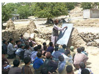
Classes were resumed even as schools were being reconstructed. (Afghanistan)

As long-awaited rains dampened the dried-up grounds in the spring of 2002, the roughly 6,000 families who had spent the winter under tents distributed by PWJ returned to their respective communities. The state of emergency had finally come to an end and reconstruction had begun. The path to the reconstruction of Afghanistan is long and harsh, as the country has been ravaged by years of wars, draughts, and air raids. PWJ is now making full effort to pave this path as securely as possible.