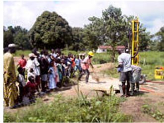
The solid rocks of Kono District can only be tackled by drilling machines. PWJ is one of the 2 agencies that possess drilling machines in Sierra Leone.

Peace Winds Japan (PWJ) has been active in Sierra Leone since 2001, when thousands of Sierra Leonean refugees surged to their homeland. There were two factors that prompted this movement. Firstly, signs of peace had begun to appear in Sierra Leone after over 10 consecutive years of internal conflict. Secondly, wars in neighboring countries, where many Sierra Leoneans were taking refuge, escalated. Most of the returnees originated from areas in Sierra Leone where particularly severe battles were fought, such as Kono and Kailahun Districts. These areas remained unstable even after the peace accords had been set, leaving many returnees stranded, unable to go back to their hometown even after their return. To cope with the situation, PWJ constructed and operated a returnee camp, providing water, foods, and living necessities for such people.